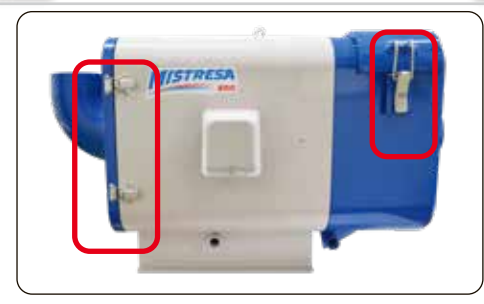
Clamping system allows to open and close without tools!