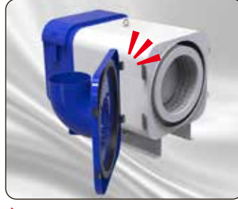
Single-hinged lid: The lid is also removable!